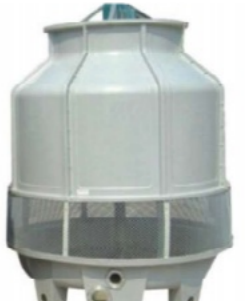
Water Cooling Tower